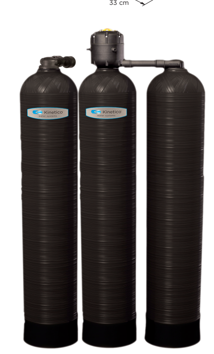
Kinetico Model 1060 Dechlorinator Combination (additional configurations available)